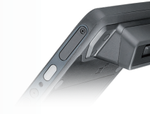
Barcode Scanner (70°)