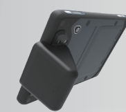
UHF RFID Reader