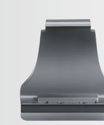
Wall Mount Dock