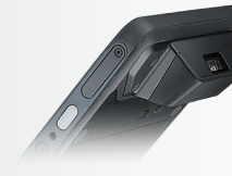
Barcode Scanner (20°)