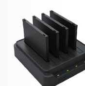
Multi-Battery Charging Station