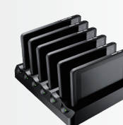
Multi-Tablet Charging Station